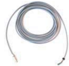
Serial cable RS232 + pigtail